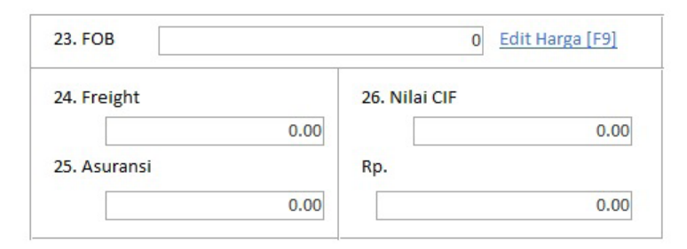
Figure 1: Import declaration application fields related to customs value