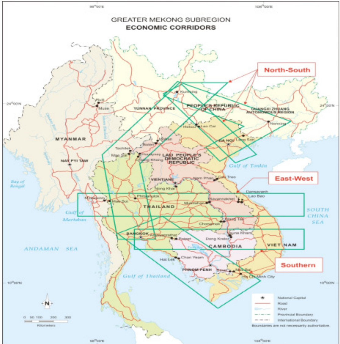
Figure 1: GMS Economic Corridors

However, even with such a cooperation program, it was observed that many non-physical barriers to the cross-border movement of goods, people and vehicles still existed. In 1992, the GMS member countries had inconsistent and difficult border crossing formalities and procedures. Restrictive visa requirements and restrictions on entry of motor vehicles were normal, coupled with different standards on vehicles and drivers across countries. Transit traffic was difficult and sometimes not allowed for some member countries.