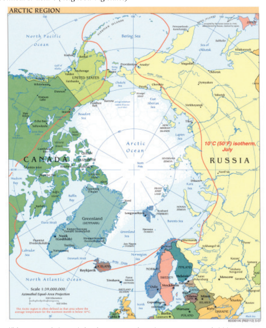
Figure 1: Detailed geographical chart of the Arctic region (Pole, Arctic Circle, subpolar region) and its political structure (neighbouring states)