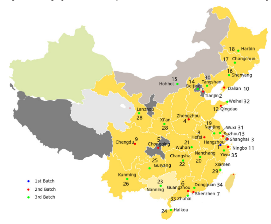
Figure 1: Geographical location of 35 cities with cross-border e-commerce comprehensive pilot area

As we can see from Figure 1, the geographical distribution of all three batches of CPAs is imbalanced, with most of the cities concentrated on the nation's centre and east coast.