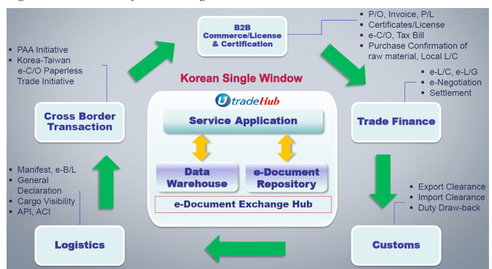
Figure 3: Framework of Korean single window