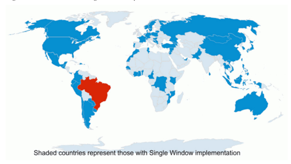
Figure 1: Countries with single window systems